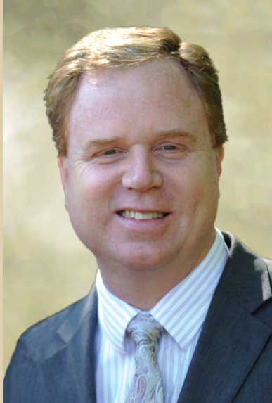
A WORD FROM OUR EXECUTIVE DIRECTOR

“And if you spend yourselves on behalf of the hungry and satisfy the needs of the oppressed, then your light will rise in the darkness and your night will become like noonday.”