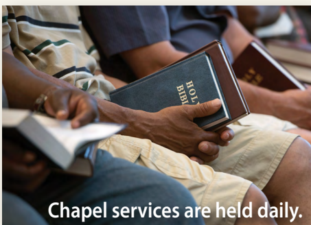
Chapel services are held daily.

"I came a long way from where I was in Chicago. The Mission is a blessing. I know God sent me here for a reason. My boss loves me. Everything is going great." His next goal is to get housing. He knows when it happens he will count one more "win!"